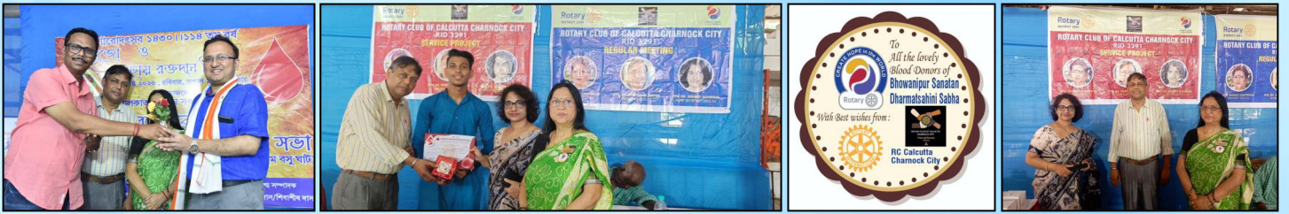
CO HOSTING A BLOOD DONATION CAMP ON 12TH AUGUST 2023