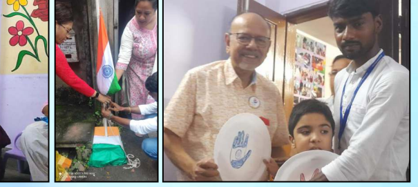
VISIT TO PRATHAM PDAKKHEP A HOME OF SPECIAL CHILDREN ON 15TH AUGUST 2023