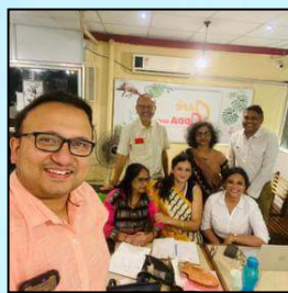
FIRST BOARD MEETING OF 2023-24 ON 12TH AUGUST AT CAFÉ ADDAGHAR