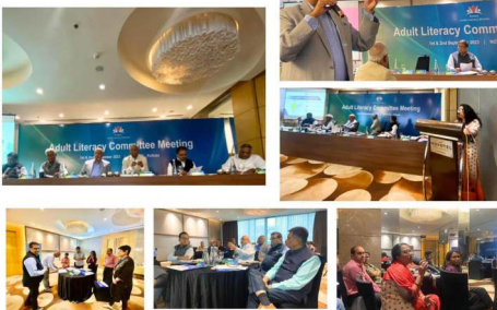
A Glimpse of Adult Literacy National Committee Meeting

A two-day-long conversation was splendid at Kolkata!