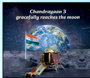
Chandrayaan 3 gracefully reaches the moon