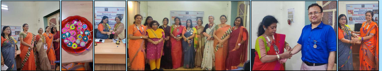
ACTIVITIES OF 483RD REGULAR MEETING & RAKSHA BANDHAN ON 31ST AUGUST 2023 AT COMMUNE