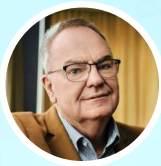
RI PRESIDENT 2023-24 Rtn. GORDON R MCLNALLY