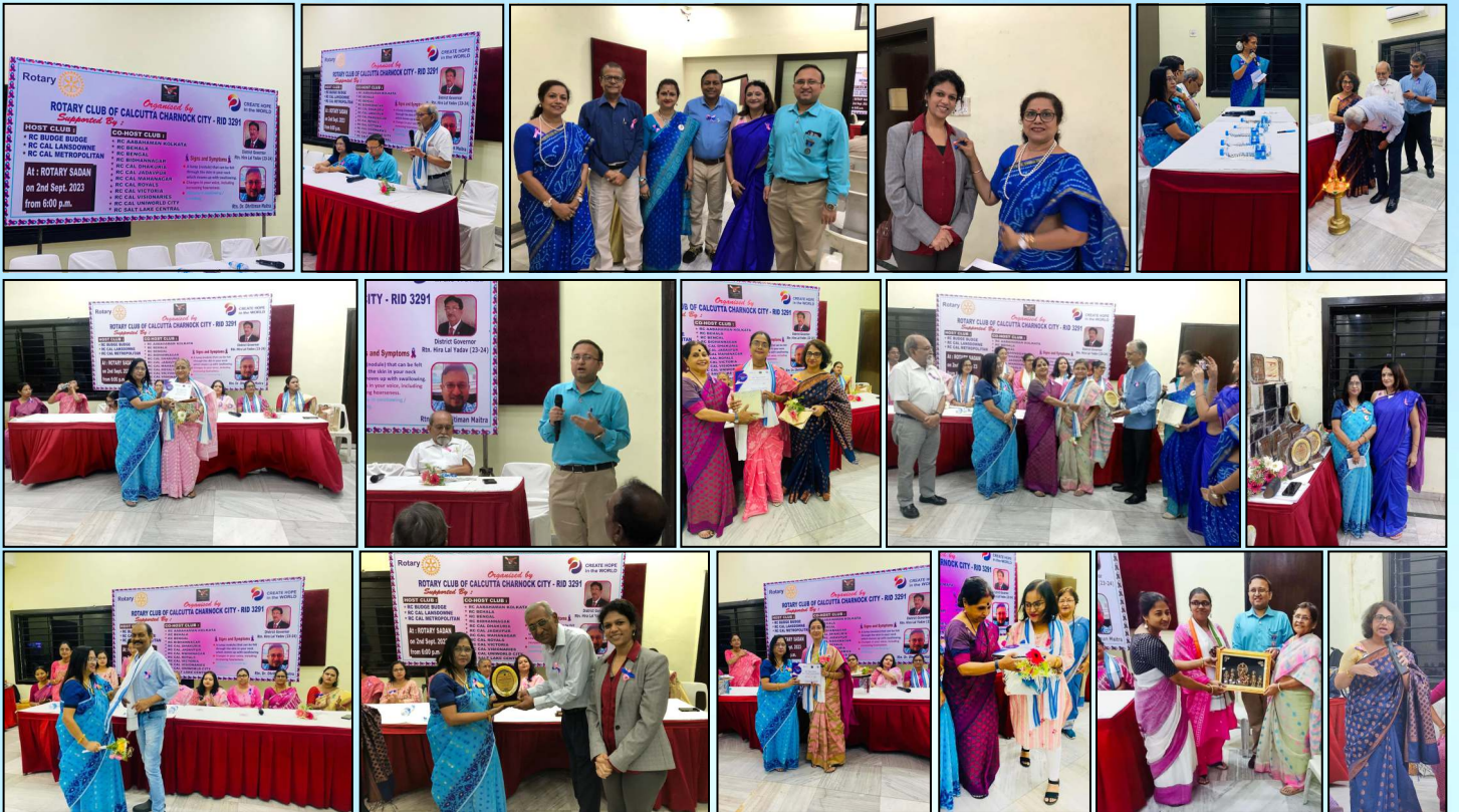
MEET OF THYROID CANCER SURVIVORS & POST-THYROIDECTOMY PATIENTS TO OBSERVE THYROID CANCER AWARENESS MONTH