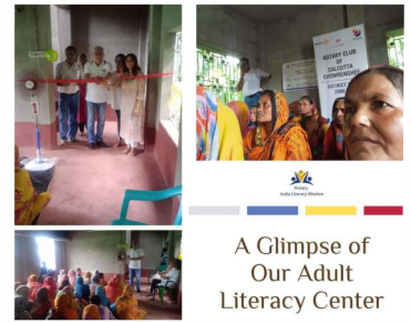
A Glimpse of Our Adult Literacy Center

We are glad that the Rotary Club of Calcutta Chowringhee has supported us in transforming 265 non-literate adults into literate individuals through these centres.